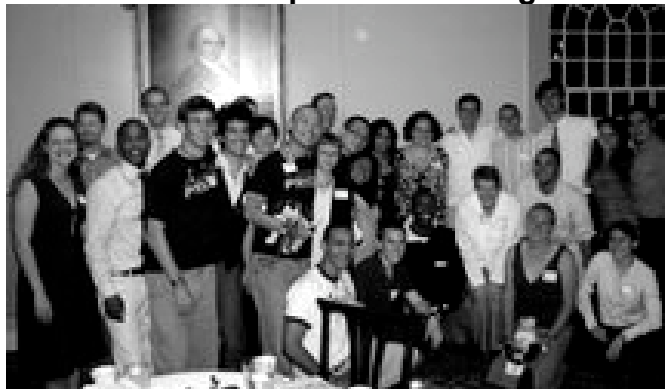
Students, Alums and Friends at PRIDE Dinner at Hanover Inn (Daniel Webster Looks On!)

The Dartmouth Gay Straight Alliance hosted Dartmouth's first-ever PRIDE Week from May 7th to 11 th this year. The weeklong event was intended to raise awareness about the LGBT community's experiences today and throughout Dartmouth's history. DGALA alums participated extensively in the event, and DGALA also provided significant